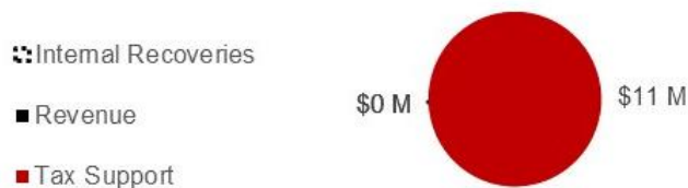
Mayor and Council 2022 Budgeted Gross Operating Expenditures Funding Breakdown ($ Millions)

Note: Internal recoveries is how The City accounts for the costs of goods or services between services